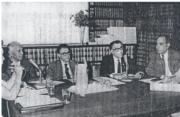
Figure 6. A picture of the International Seminar of the Human Plague, Pasteur Institute of Iran, 1970.

The Bacteriology Department of the Pasteur Institute of Iran was established in 1953 23 and was a pioneer in research on epidemic diseases, including the human plague. An international plague seminar was held at the Pasteur Institute of Iran in 1970 (Figure 6). 20