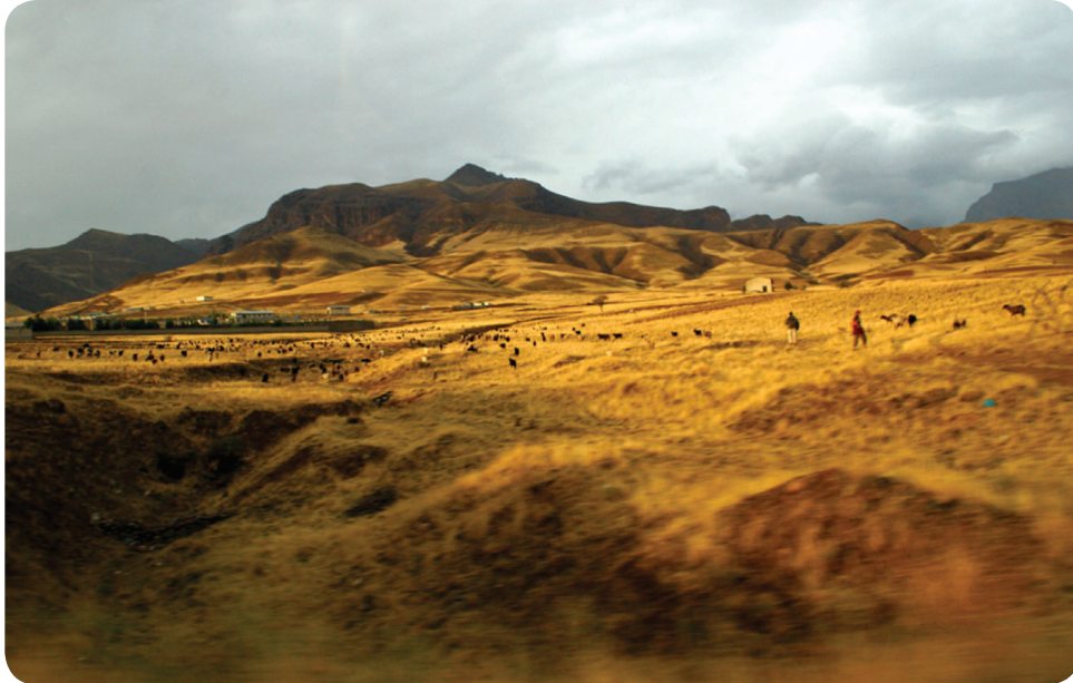
Alamut, around 100 km from present-day Tehran - Qazvin Province -Iran