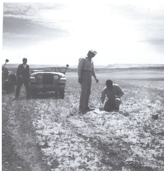
Figure 2. The investigative team of the Pasteur Institute of Iran evaluating plague bacilli infected reservoirs among the rodents in Kurdistan Province, Iran 22