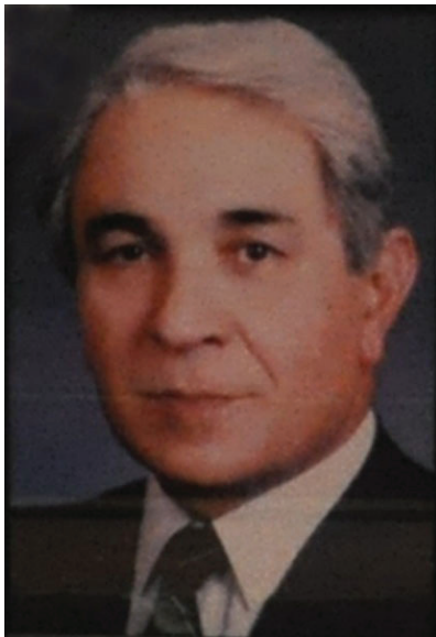
Figure 4. Dr. Younes Karimi (1929 – 2009), a prominent Iranian researcher of the human plague